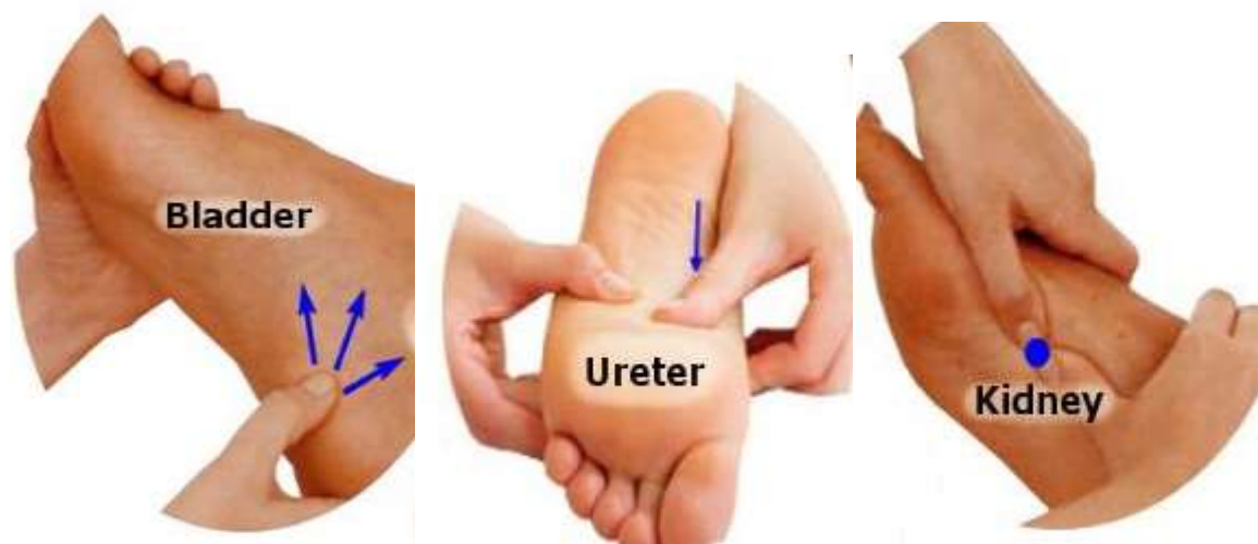
Figure 2. Reflexology points in Kidney, Ureter and Bladder Areas