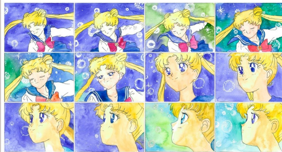
Figure 5. Sailor Moon, by Selen Akdaş (Student animation project).

Figure 4 illustrates a student work. Freshmen students at Visual Communication Design Department who take the course of "Animation Production Techniques" are required to make a flip book animation project in order to understand the first stage of creating a motion picture form. In the first week, the students are shown examples of flip book in a historical framework and they are provided with detailed information for creating alternative flip book methods and they grasp the concept theoretically. In the half-term project, the student began to compress a conversion scene from the main character of the Japanese cartoon series "Sailor Moon" into a series of 96 frames. Pencil and marker pen for coloring are used for the application.