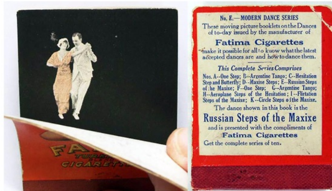
Figure 2. The Maxixe. Liggett & Myers Tobacco Company, Fatima moving picture dance book, 1914. 50 x 65 mm. Reprinted from Kineographs. Princeton University Library, Graphic Arts Collection, J. Mellby, 2010, February 10, Retrieved from https://www.princeton.edu/~graphicarts/2010/02/kineographs.html

Flipbooks were popularized in the early twentieth century by various manufacturers who gave their customers away as free in-pack prizes (Bendazzi, 2016, 15). For instance, The Liggett & Myers Tobacco Company manufactured a Turkish cigarette brand under the name Fatima. The company marketed Fatimas via various platforms such as magazines, radio, and television. Flipbooks were one of their marketing strategies, and they released ten flipbooks with the theme of modern dance in 1914 (Mellby, 2010). This flip book (Figure 2) demonstrated dance figures and instructions gradually. This tiny books which have essence of motion pictures are still producing today.