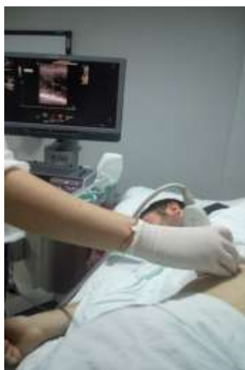
Figure 3. Ultrason probe placed on injection points.