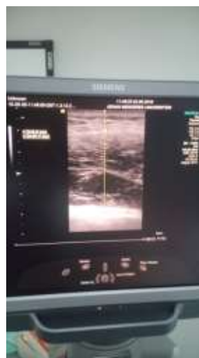
Figure 4. Subcutaneous and muscle tissue thicknesses.