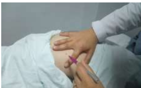
Figure 1. Determination ventrogluteal area point. ventrogluteal injection point.