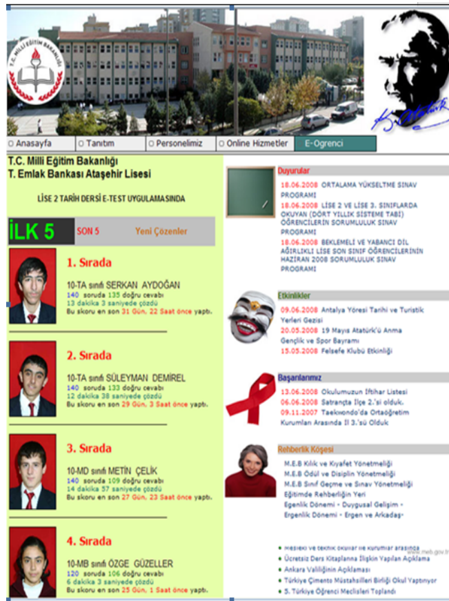
Figure 2a. Screen capture of School Web Site: Top 5 list