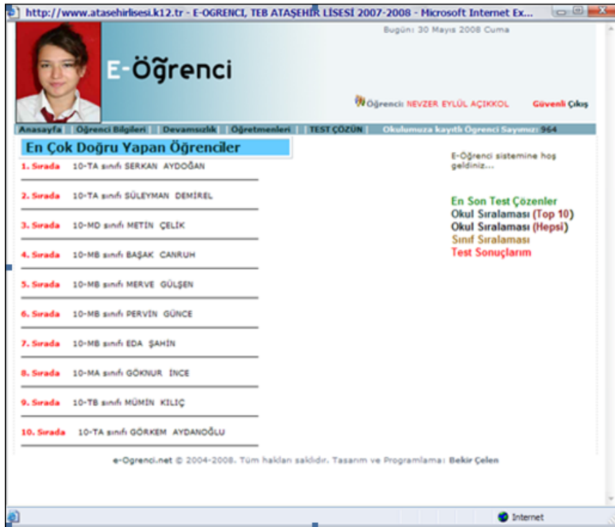
Figure 1a. Screen Capture of Web Based Application: Homepage

By developing this application, a “Top 5” students list was placed on the home page of the school (see Figure 2-a). The list consisted of the names and photos of students who gave the most correct answers, as well as some additional information including when they solved the questions, how much time he used, and his scores on the website. There was also a “Bottom 5” list to create a negative motivation for students and make them solve more questions. Also for motivation purposes, the list of the students that last solved the tests was also added to the home page. Therefore, the students could look at the home page to the “New Solvers” part to learn information such as “the names of the students who had recently used the application and solved the questions, how long ago they solved the questions, how many true answers they had given” to follow the competitors in this competitive system (see Figure 2-b).