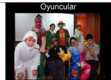
Figure 3. A screen image of the video, The King And The Theatre