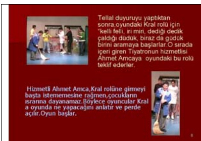
Figure 1. A screen image of the ELVES presentation

Neither the video-educated students or those experiencing the computer-aided ELVES method had ever read the text of The King and the Theatre or seen its theatre adaptation. In order to induce the children to follow the educational methods carefully, we had the teachers distribute a video-watching form to the video-educated children and a presentation follow-up form to those who took part in the ELVES method and ask them to fill them in during the session.